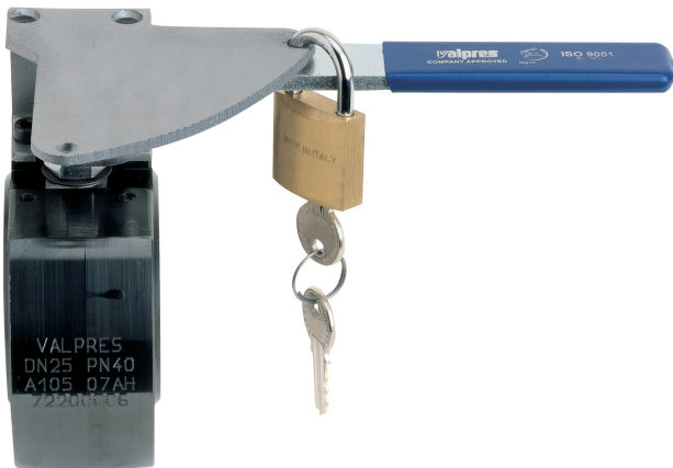
Locking handle device (lockpad excluded).